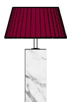
White Marble 130262