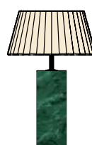
Green Marble 130464