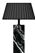
Black Marble 130363